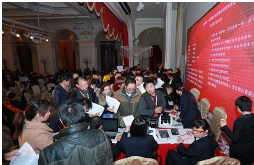
The "Investment Fair of Daminggong Construction Material and Furniture Base" received overwhelming responses.